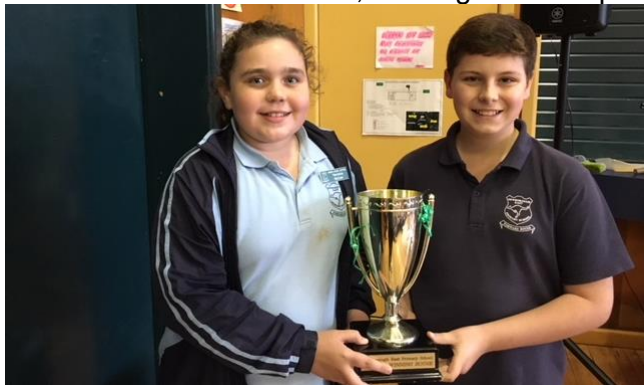
Respectful Roo winners

WELL DONE Green house, winning house cup.