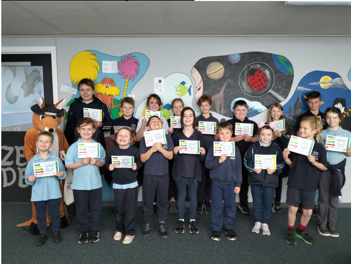
Red House Wins