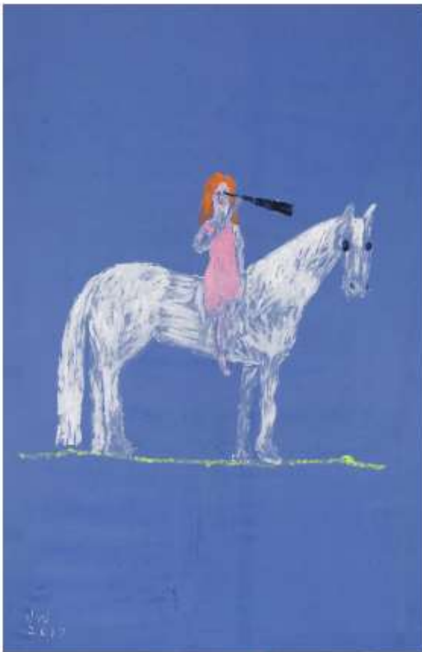
Image: Jenny Watson, White Horse with Telescope , 2012, synthetic polymer paint on rabbit skin glue primed cotton, 200 cm x 130 cm, Latrobe Regional Gallery Collection, purchased 2023. Courtesy the artist and Anna Schwartz Gallery

Note: Physical artworks will need to fit within the size outlined below. Not all physical artworks are guaranteed to be included in the display because of the limited space available. This is why we are calling for digital scans so that we can include as many artworks as possible.