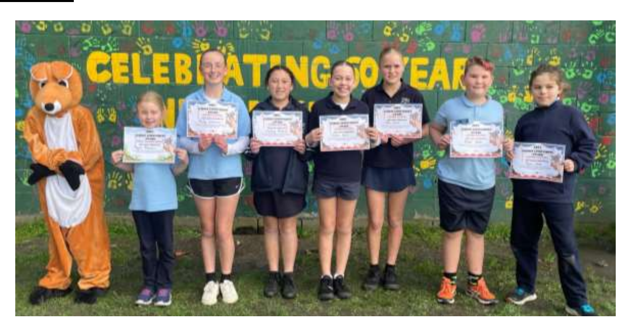
Yellow House Wins